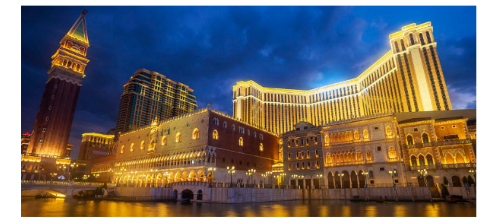
The Venetian Macao