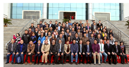
CMSE 2014 in Shanghai