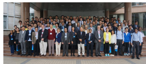
CMSE 2013 in Xianning