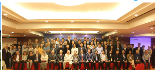
CMSE 2017 in Beijing