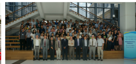
CMSE 2015 in Macau