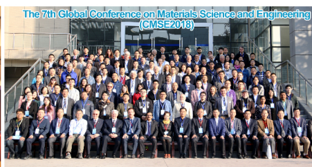
CMSE 2018 in Xi'an