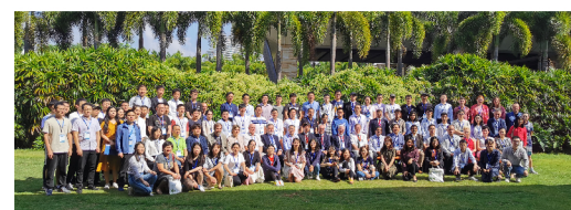
CMSE 2019 in Sanya