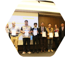
Best Oral Awarding