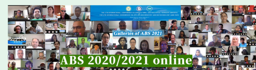
ABS 2020/2021 online