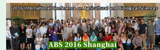
ABS 2016 Shanghai