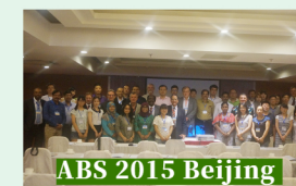
ABS 2015 Beijing