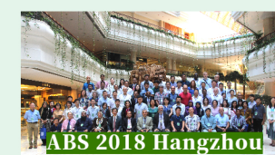
ABS 2018 Hangzhou