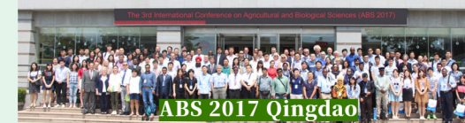
ABS 2017 Qingdao