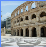
Macau Fisherman's Wharf