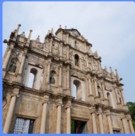
Ruins of St. Paul's

Macau is a Special Administrative Region (SAR) of the People's Republic of China, and it is located on the Southeast coast of China to the west of the Pearl River Delta. It has a prosperous economy featuring four pillar sectors: tourism & gambling, export processing (mainly textiles and garments), banking, and construction & real estate. It is a combination of regions and architecture including squares, churches and temples that demonstrate how Chinese and Western cultures have blended over the past 400 years.