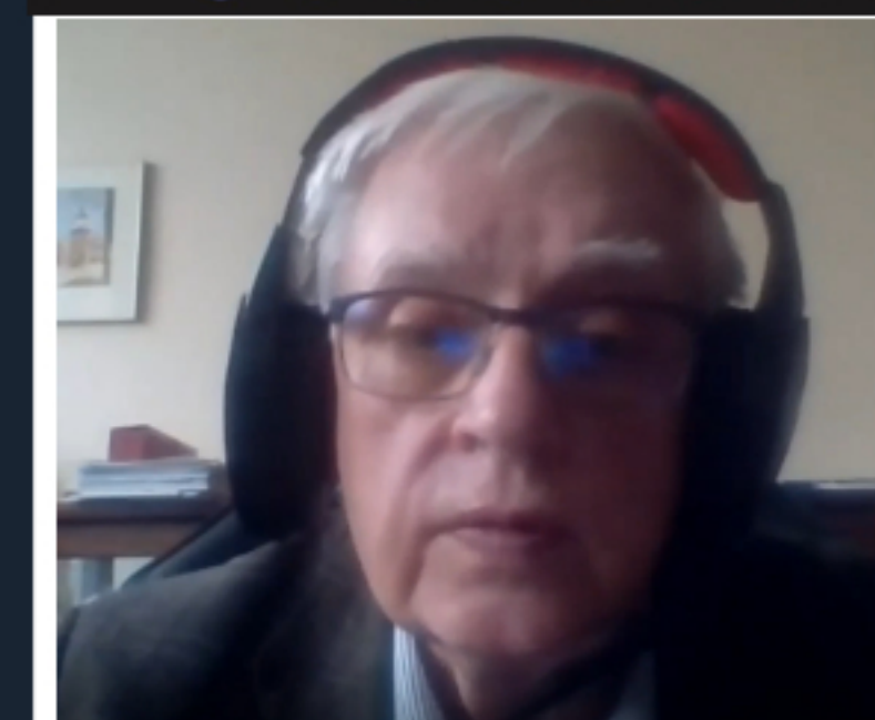
CECNet2020 by Teams