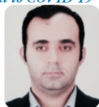
Special Session Chair: