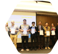
Best Oral Awarding