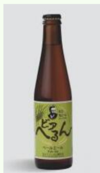
Local Sake and Beer